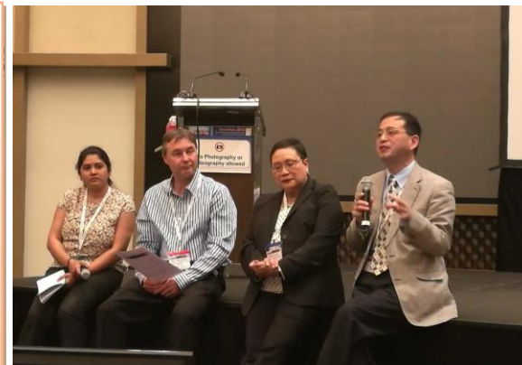
FOP WORKSHOP Q&A SESSION